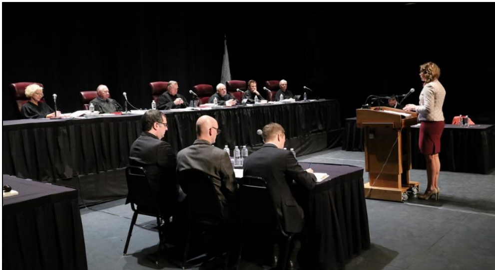
The Supreme Court hears oral arguments at the Krannert Center on the campus of the University of Illinois Urbana-Champaign.

The Supreme Court has held oral arguments in other locations in Illinois to raise awareness of the judicial branch and of the important role the court system has in interpreting state laws. This outreach into various communities in Illinois has been a tremendous success, particularly with students, who gain a better understanding of state civics. In the past, the Court has met at Mt. Vernon in 2008, in Ottawa in 2014, and in Lisle in 2016. During the March 2018 Term of the Supreme Court, the justices heard oral arguments while “traveling the circuit” in Champaign, Illinois on the campus of the University of