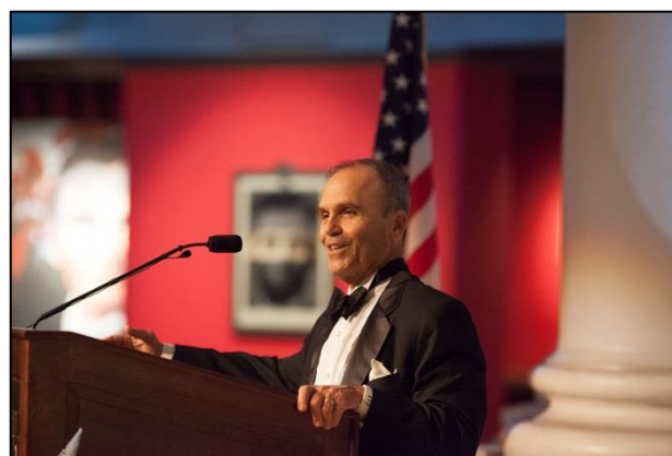
Illinois lawyer and best-selling author Scott Turow was the keynote speaker at the Gala.