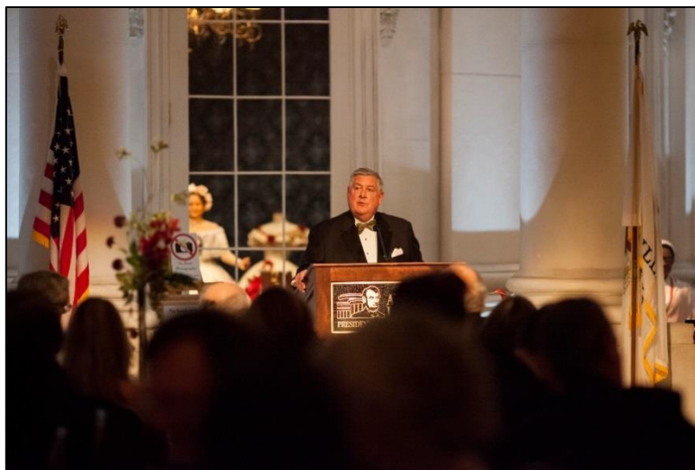
Commissioner Kirk W. Dillard addresses the Gala attendees.